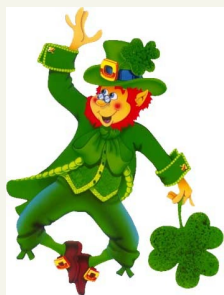
Happy St. Patrick's Day